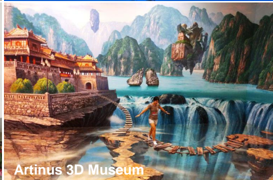
Artinus 3D Museum