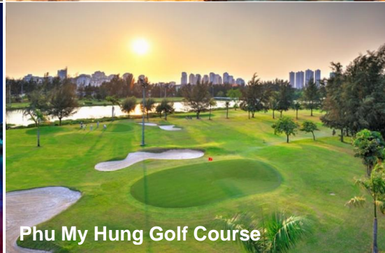
Phu My Hung Golf Course