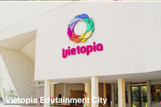
Vietopia Edutainment City